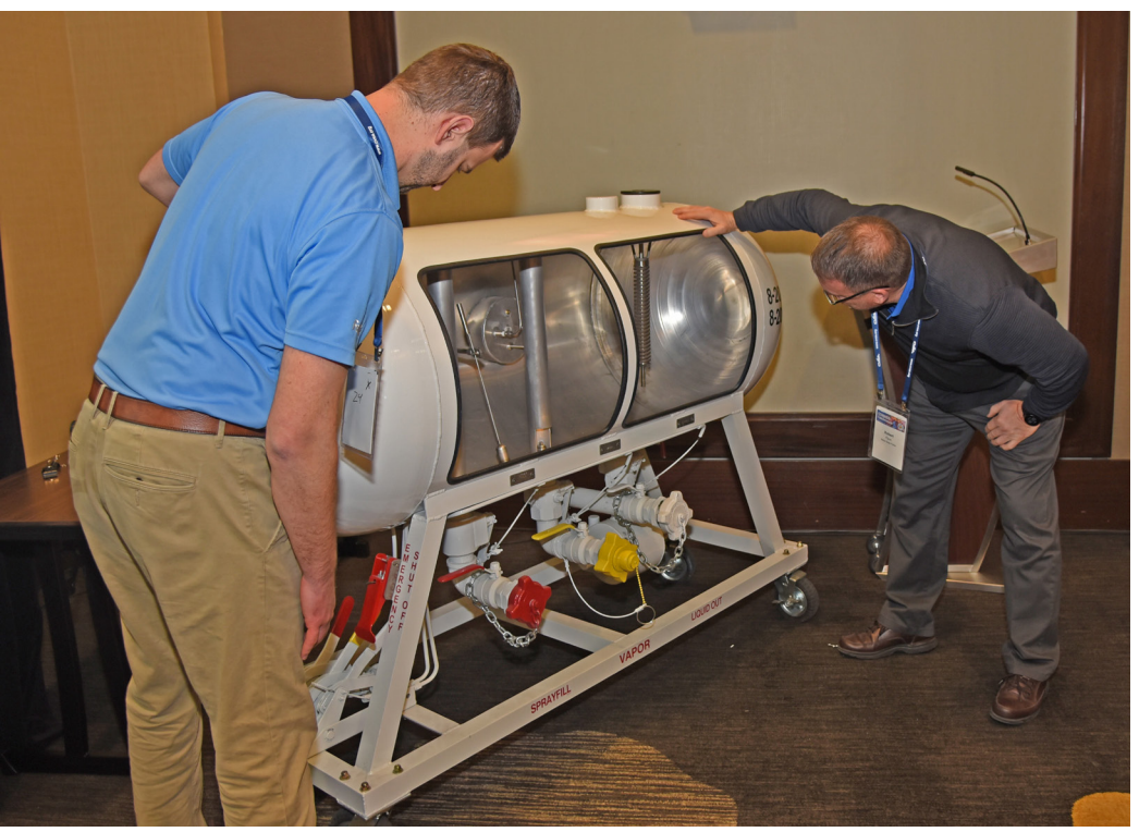
Attendees at the COHMED Conference check out a cargo tank model of a high-pressure tank.

Individuals gather at the Cooperative Hazardous Materials Enforcement Development (COHMED) Conference to discuss topics and issues related to the regulation, enforcement and safety of transporting hazardous materials/dangerous goods. The COHMED Conference was held Jan. 23-27 in San Antonio, Texas. There were 319 attendees and three exhibitors.