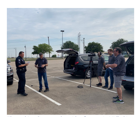
The multimedia team shot video footage in Midlothian, Texas, for CVSA's traffic-enforcement training course for non-certified officers.