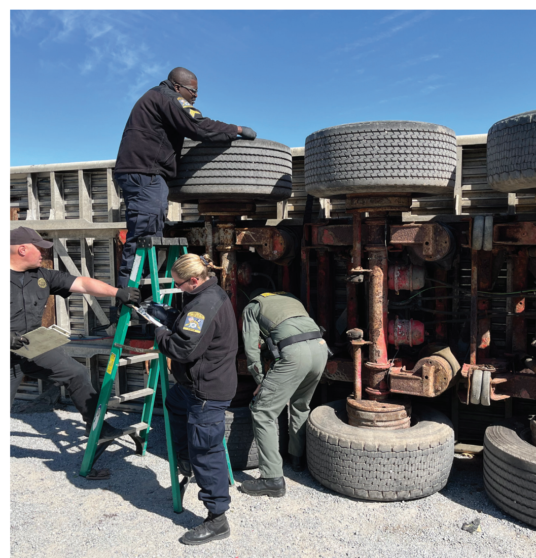
In CVSA's Post-Crash Inspection Training Course, inspectors learn how to determine a crash's causal factors.

In addition, the multimedia team shot video footage for use in CVSA's Post-Crash Inspection training course materials.