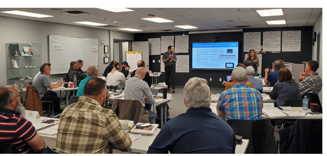
Attendees at this industry training course learned about Canadian driver inspection regulatory requirements and out-of-service conditions.