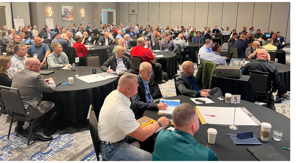
Motor carriers, enforcement and government personnel, technology developers, and association representatives attended CVSA's Level VIII Electronic Inspection Forum.